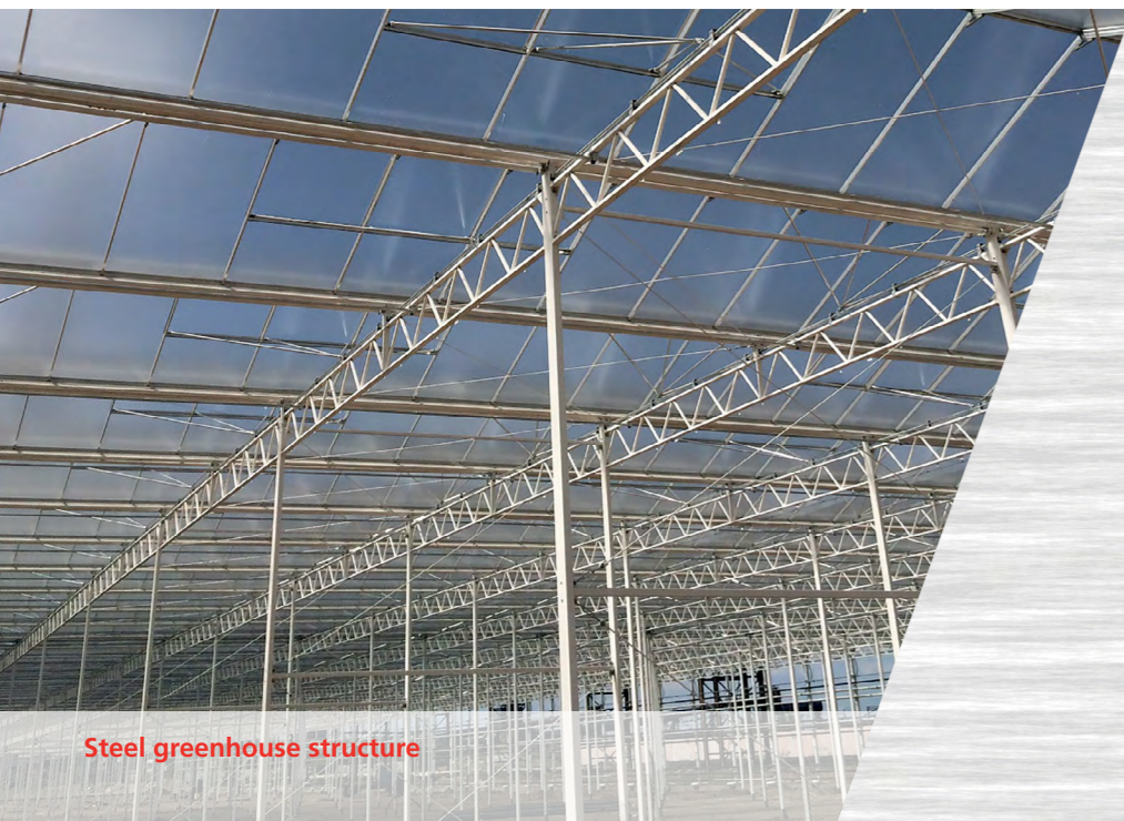
Steel greenhouse structure