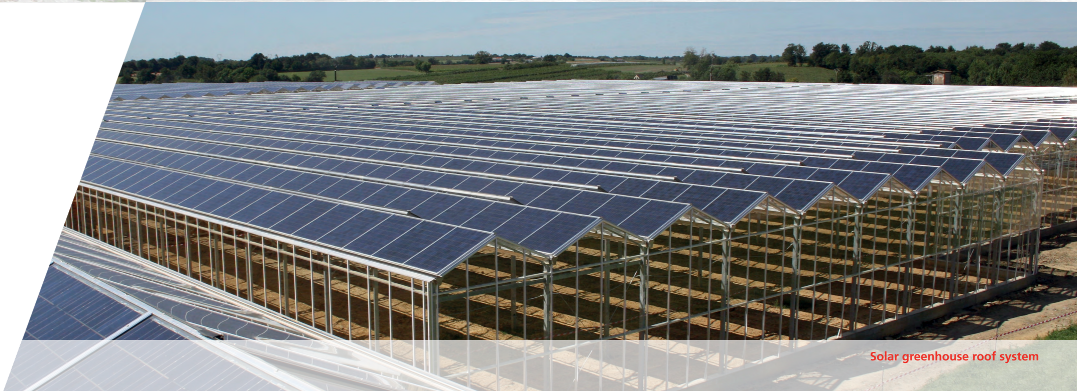
Solar greenhouse roof system