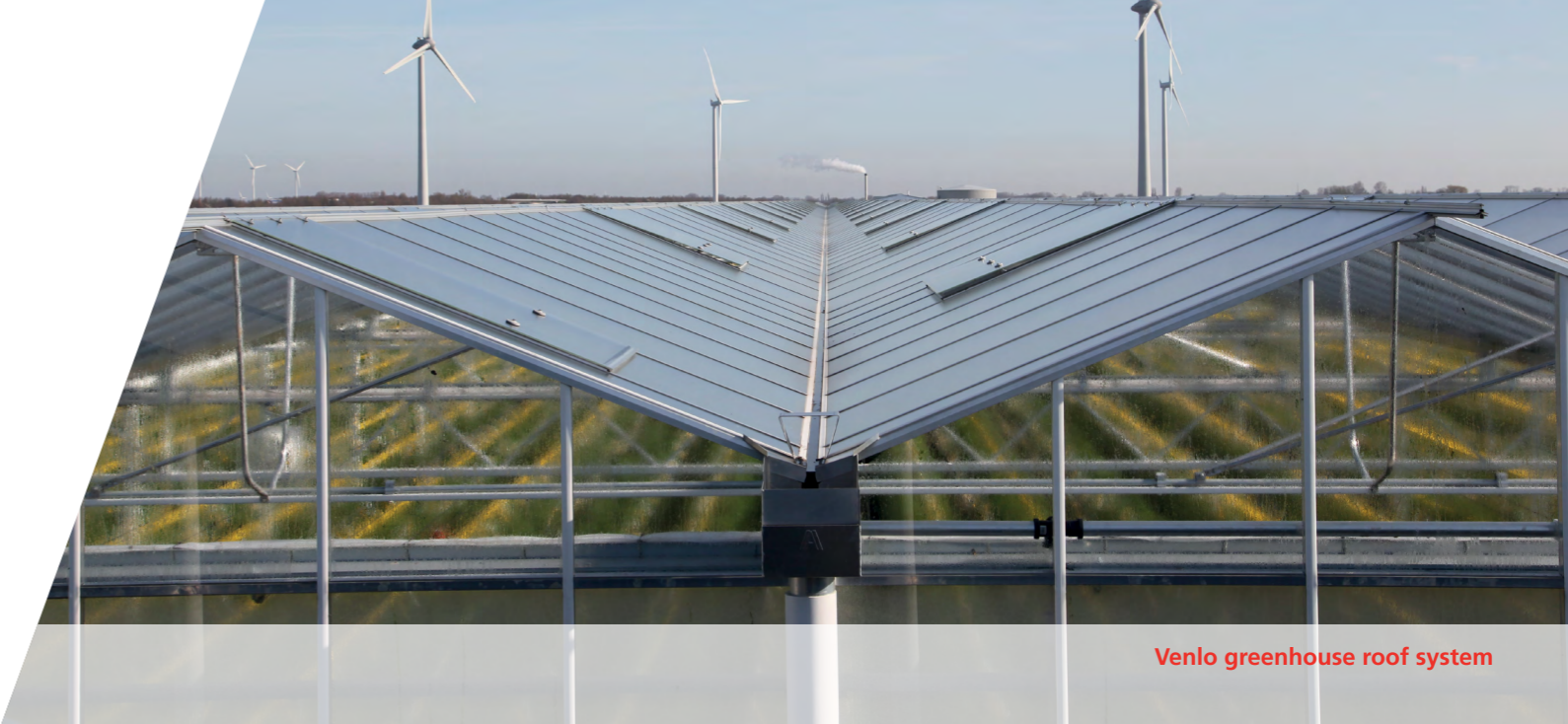
Venlo greenhouse roof system

NB: All our greenhouse systems can be equipped with glass, polycarbonate, insulation and solar panel roof systems.