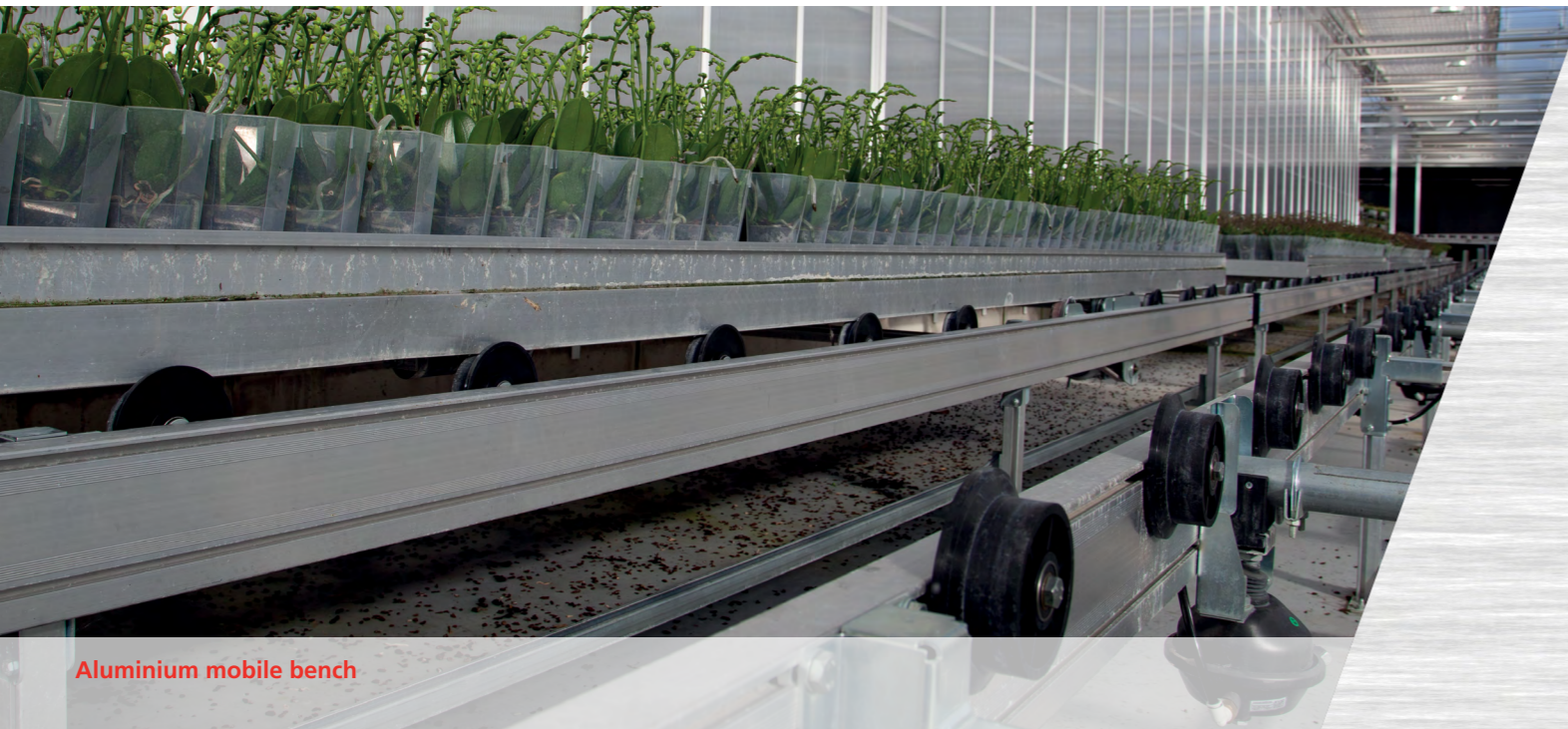
Aluminium mobile bench