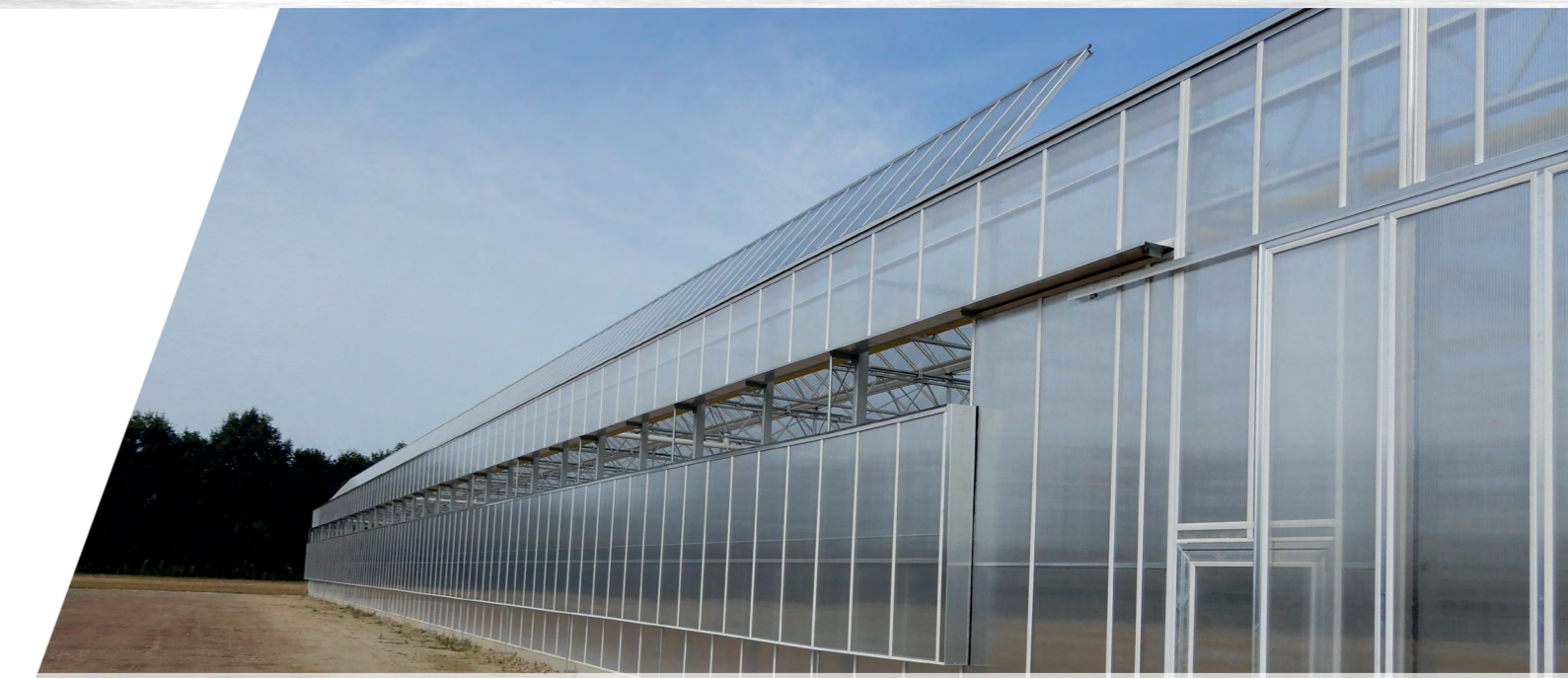
Cabrio greenhouse roof system provided with smart gable venting system