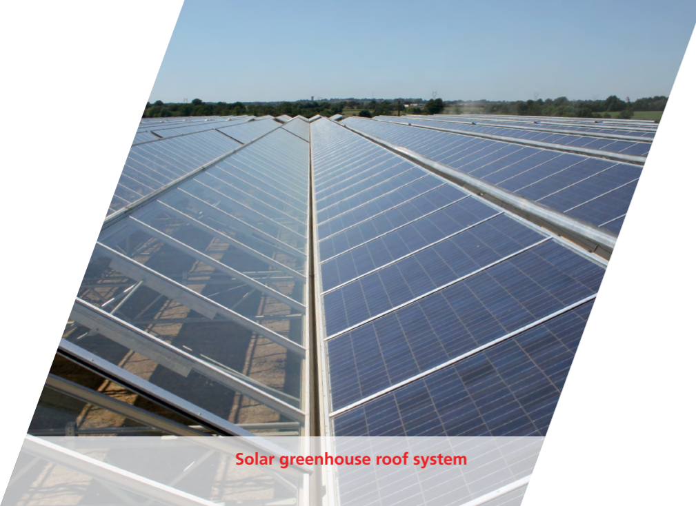
Solar greenhouse roof system