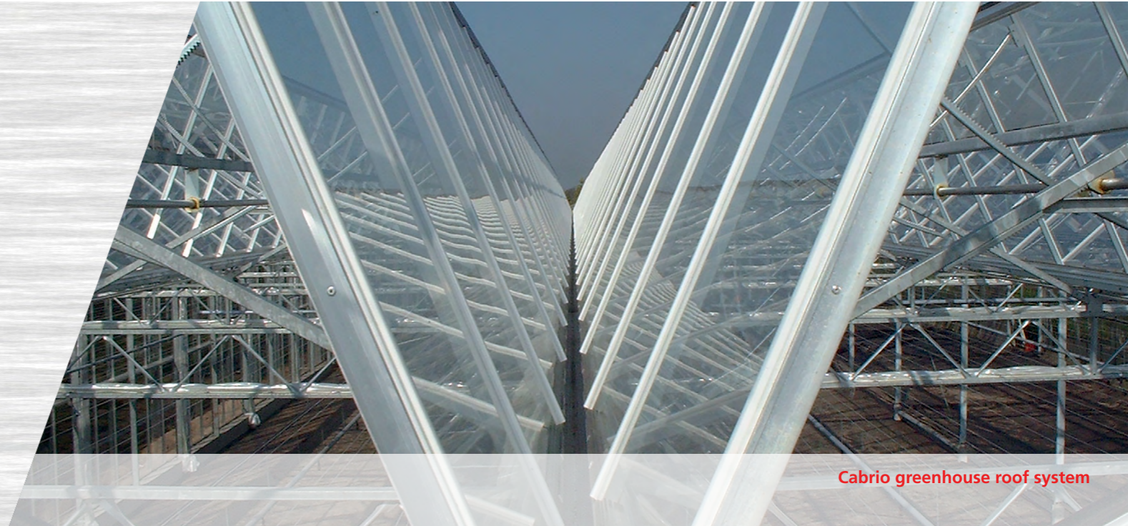
Cabrio greenhouse roof system

The system is suitable for roofing in glass.